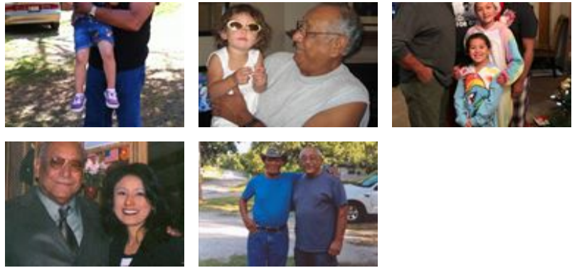
Wooster Funeral Home & Cremation Services - March 26, 2018 at 02:45 PM

“ 25 files added to the album Life Tributes